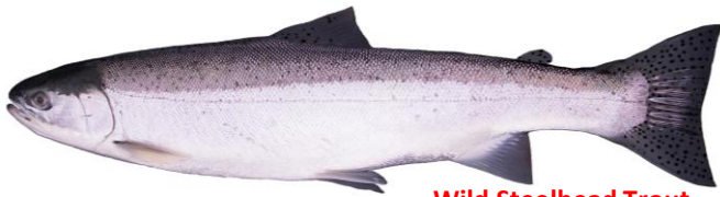
Wild Steelhead Trout

CLOSED TO RETENTION THROUGHOUT REGION 2 (LOWER MAINLAND)