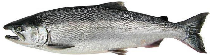
Wild Coho Salmon*